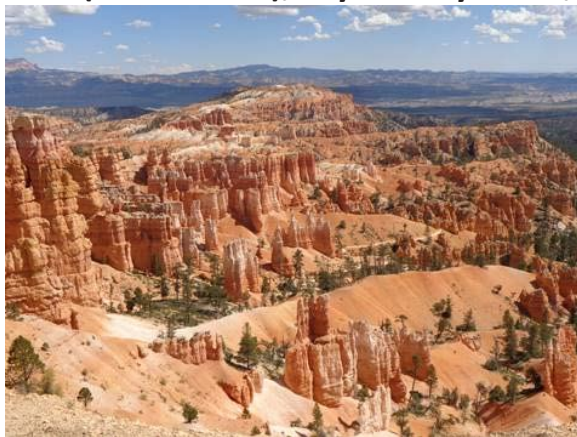
BRYCE CANYON NP

We started our National Parks' tour with Mt. Rushmore, then Crazy Horse Monument, Devils Tower, Little Big Horn, Big Horn Mountains, Buffalo Bill Historical Center, Yellowstone NP (Old Faithful), Grand Teton NP, Snake River Whitewater Tour (senior level), Bryce Canyon NP,