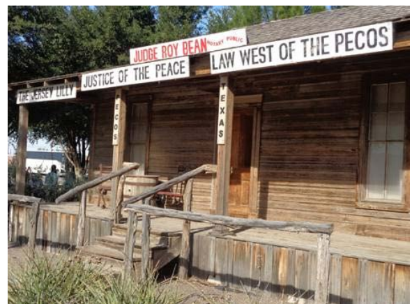
JUDGE BEAN'S "COURTHOUSE"

Yes we were so impressed by the tour that we took a second National Parks' bus trip touring the Big Bend National Park in Texas along the Rio Grande River, then Fort Davis along the San Antonio-El Paso Trail established 1854, The Orient Hotel & Saloon where Roy 'The Hanging Judge' Bean presided court and home of many wild west shootouts.